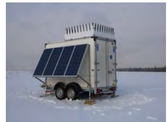
SODAR in trailer with solar panels