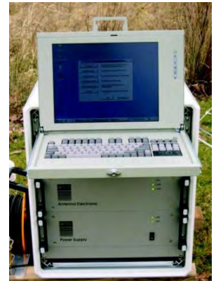
Outdoor unit: pc and electronic